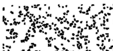
Figure 2a. Individual bee regions