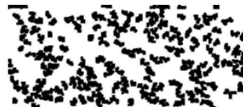
Figure 2b. Regions include plural honeybees