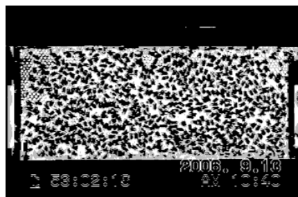
Figure 1b. Original Image