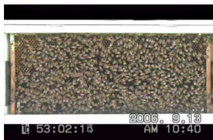
Figure 1a. Original Image

Vector quantization method has been applied for various fields, image compression, signal processing, machine learning and so on [4]. It can be approximated each training vector by predetermined code vectors. We applied it for classification of objects, honeybee, nest and other things. In our preliminary analysis, it is shown that objects in the original image were classified into eight categories, and one of these is corresponded with the candidate of honeybee bodies. Therefore, it is possible to extract honeybee body regions by quantized the vector.