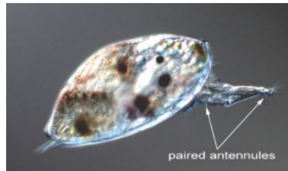
Figure 1. Interference contrast light micrograph of a cyprid larva of the tropical barnacle, Balanus amphitrite . The paired antennules used to explore the substratum are arrowed.

The tropical barnacle, Balanus amphitrite , is an economically important fouling species (it settles on natural and artificial submerged surfaces) with a short generation time and larvae that are relatively easy to culture in the laboratory. These attributes have contributed to its acceptance as a model species for larval settlement studies. The settlement stage larva - the cyprid (figure 1) - measures approximately 0.5 mm in length and is capable of swimming at high speed. On encountering a surface, the cyprid typically displays searching behavior, in which the cyprid 'walks' over the surface using the attachment discs of its paired antennules. This behavior has proved difficult to measure in detail by conventional means. Knowledge of such behavior is nevertheless important to the development of methods to interfere with this process, i.e. antifouling. The present investigation aimed to determine whether the settlement behavior of such small organisms was amenable to analysis by EthoVision and if so, to see how to optimize its use.