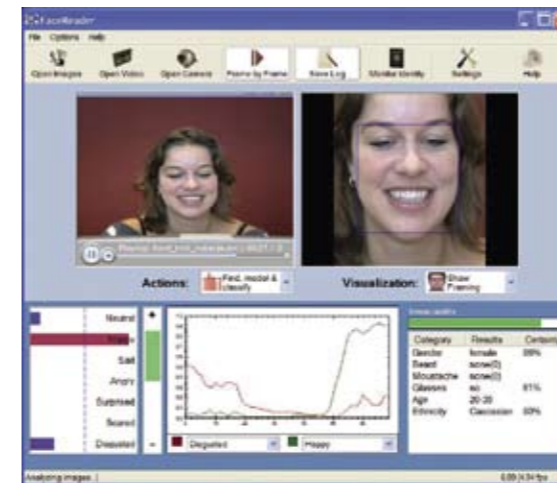
The FaceReader interface, showing the test person's face, the facial expressions, and a number of other properties.

Data acquired with FaceReader can be easily imported into The Observer XT, our software package for collection, analysis, and presentation of observational data. This offers a unique solution for synchronization, integration, and analysis of FaceReader data with other data, such as manually logged events, physiological data,