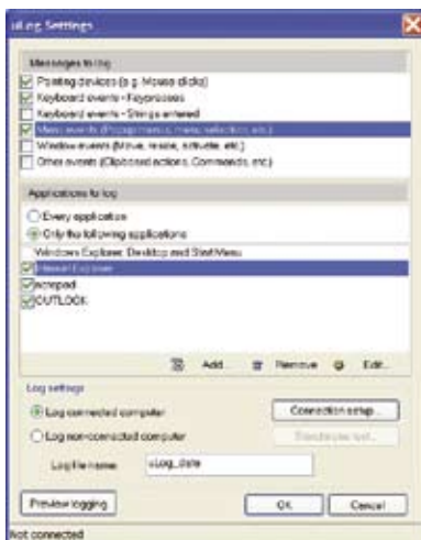
uLog allows you to select which events and which applications to log.

Take your research one step further and consider taking facial expressions, eye movements[1], and physiological measurements into account. Moreover, with a screen capture device you can follow the movements on the user's computer screen one-on-one. The Observer XT works as a platform. It enables you to combine all these different data streams.