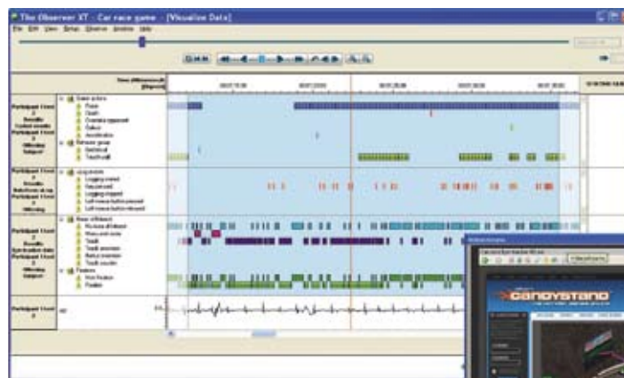
Data from a gaming study: synchronized and visualized in The Observer XT. It shows you different data streams (eye tracking, behaviors, physiology) on one timeline.

To get insight into the efficiency and effectiveness of a system, The Observer XT provides detailed visualizations and analysis options. Explore the data with the visualization. Then look at customized charts and statistics. You can specify relevant parts for analysis by filtering participants and behaviors. For additional calculations